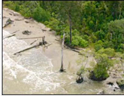
Coastal trees are being submerged as the strain accumulates

It was followed by a magnitude 8.7 in March - with the rupture occurring further south along the plate boundary.