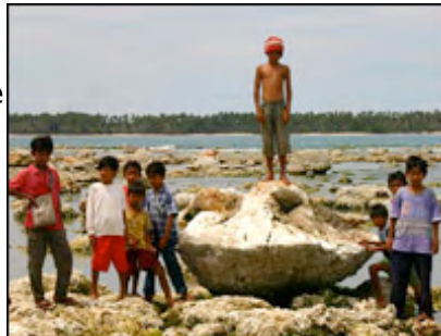
After a quake, land that had been pulled down will pop back up

In fact, the plates move in "stick-slip" fashion, which means land at the leading edge of the overriding plate is pulled down briefly before suddenly slipping back up, generating a large earthquake.